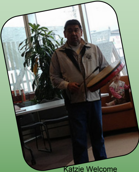
Katzie Welcome Family Literacy Day