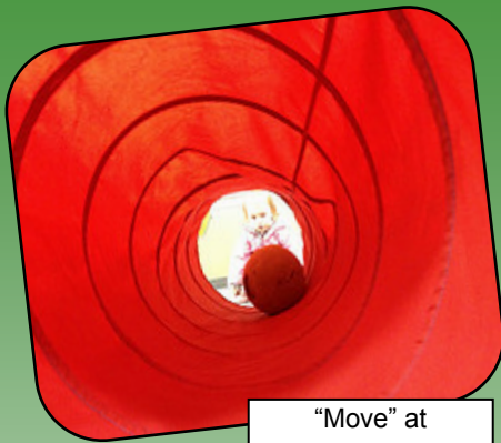
"Move" at Family Literacy Day